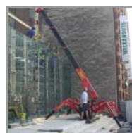
Level operation on uneven sites