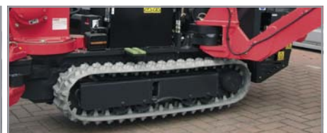
Low marking tracks