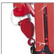
Automatic hook stow

* Rated loads for the URW-094 include 15kg 2-fall hook block.