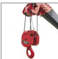
Anti two-block system