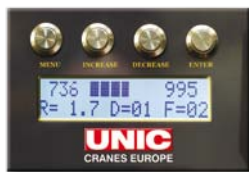
Full safe load indicator