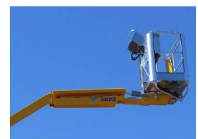
Fly jib (option)