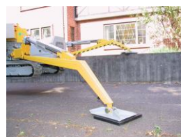
Easy set up